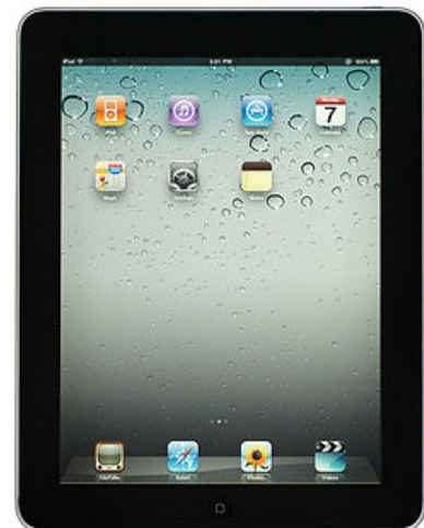
Figure 3: Apple's iPad

... some ebook readers work better than others in sunlight.