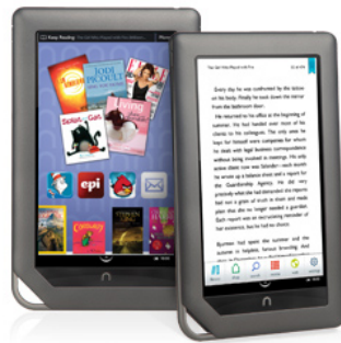
Figure 2: Barnes & Noble's Nook