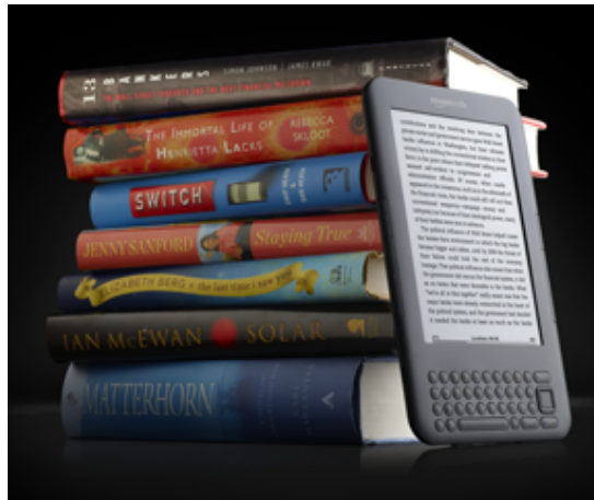
Figure 5: Traditional Books vs. Amazon's Kindle

Most ereaders also give you the ability to alter the font size of the text — in effect, this instantly turns any book into a large print edition, even titles for which no large print actual book may have been published.