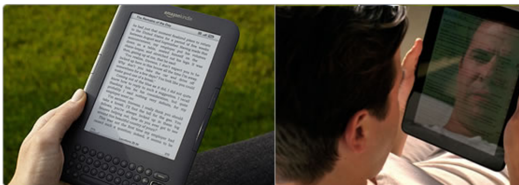
Figure 4: Amazon.com's E-ink vs LCD screen comparison in sunlight

... some ebook readers work better than others in sunlight.